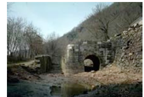
Lock 33-C&O Canal, 1978

The morning of Saturday April 10 we plan to visit Little's Falls Lock in Bloomery. Services in the area are limited so we plan to carpool to Little's Falls. The afternoon includes touring a building constructed of timbers taken from gundalows, viewing gundalow parts recovered from the Great Dig in Richmond, visiting some sites on Virginus Island along the former Shenandoah Canal, and time permitting, take in some sites on the C & O canal. We will finish off the day with our annual banquet at the conference center at 6 pm.