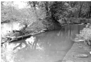
Shenlock- Strider's Mill

We will call the business meeting to order at 4:30 p.m. on Friday April 9, 2010 in the Washington Room at the Conference Center. Dinner is on your own followed by a social hour and brainstorming session. Refreshments will be provided.