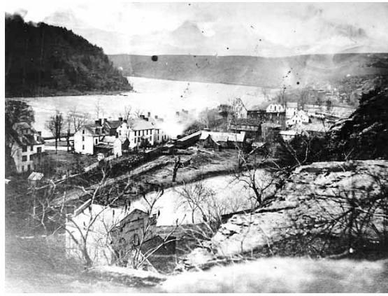
1865 view of Virginus Island from Jefferson Rock.