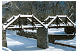
Bridge to Virginus Is. spans Shenandoah Canal